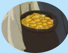
pot of gold